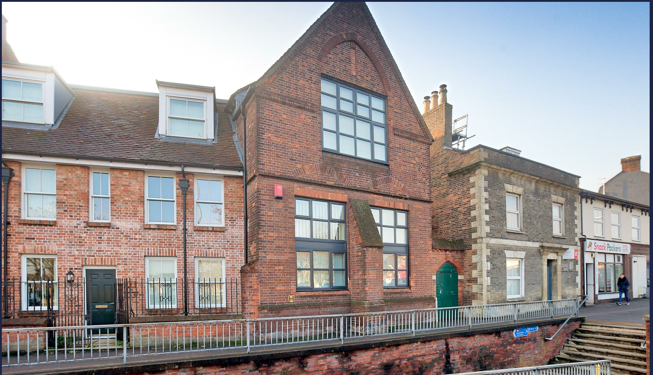
161 Fisherton Street, Salisbury